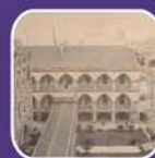
e. 育嬰堂 (聖童之家) L'Asile de la Sainte Enfance