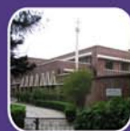
d. 加爾默羅修院 Carmelite Monastery