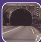
b. 獅子山隧道 Lion Rock Tunnels