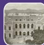
f. 舊大會堂 Old City Hall