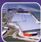
a. 亞洲國際博覽館 AsiaWorld-Expo

Which of the following French buildings are no longer existed? Please put a tick in the blanks of the correct ones.