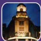
c. 利舞臺 Lee Theatre