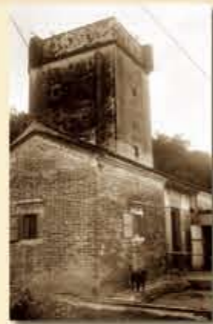
1978年的大埔頭村更樓 Watchtower in Tai Po Tau Tsuen in 1978

家塾正門石額「敬羅家塾」四字乃著名書法家鄧爾雅先生（1884 – 1954年）的手筆。鄧先生的父親鄧蓉鏡是東莞鄧氏後人，於清朝同治十年（1871年）考獲「翰林院庶吉士」。刻有其功名的牌匾，現仍懸掛在錦田清樂鄧公祠和永隆圍的門樓上。