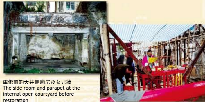
重修前的天井側廂房及女兒牆 The side room and parapet at the internal open courtyard before restoration

敬羅家塾上一次重修在1932年進行，當時使用大量現代建築物料，例如三合土和鋼鐵。經過詳細研究及與村民磋商後，古物古蹟辦事處把敬羅家塾回復至清代建築樣式，並聘請何樂文博士擔任工程顧問。