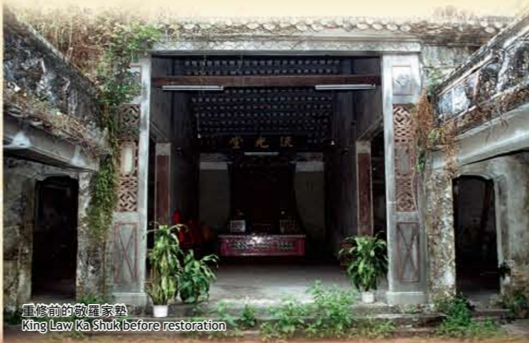
重修前的敬羅家塾 King Law Ka Shuk before restoration

在敬羅家塾復修前，古物古蹟辦事處邀得廣東省文物考古研究所在1998年9月來港為建築物進行現狀詳細測繪，並為修復工程提供寶貴意見。