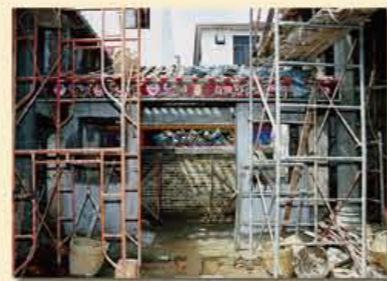
女兒牆已安放在兩房的牆壁內供人觀賞 The parapet was installed on the wall of the side room for display

Before restoration, the roofs of King Law Ka Shuk had suffered from serious leaks. All the beams were seriously rotten by termites and the walls were in bad condition owing to rising damp. Apart from repairing the defects, the careful removal of inappropriate modern building materials was another important aspect of the restoration. For instance, the Shanghai plaster on the drum platform was replaced by granite while the original red sandstone was retained; the concrete “ha gong” beams and eave boards at the main façade were replaced by traditional wooden beams and eave boards; the iron windows on the façade were removed and rebuilt with green bricks, and the flat concrete roofs of the two side rooms of the open courtyard were replaced with traditional Chinese pitched roofs. The Antiquities and Monuments Office also accepted the advice of the Guangdong Provincial Institute of Cultural Relics and Archaeology to remove the cocklofts in the side rooms of the middle hall which were added recently, and to reinstall a pair of new doors and pierced wooden screen with floral pattern above the “dong chung” (the first screen door after the main entrance).