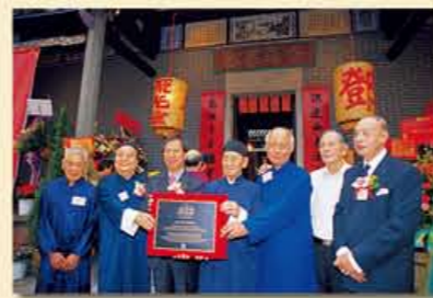
敬羅家塾的重修項目榮獲聯合國教科文組織亞太區文物古蹟保護獎優異項目獎 The restoration project of King Law Ka Shuk won the Award of Merit of the UNESCO Asia-Pacific Heritage Awards for Culture Heritage Conservation

In 2001, the restoration project of King Law Ka Shuk won the Award of Merit of the UNESCO Asia-Pacific Heritage Awards for Culture Heritage Conservation. The selection panel cited the project for its application of best practice methodology in renovation and its demonstration of the value of restoring and conserving a historic building for community use. Carried out through a balanced conservation approach and strong community involvement, the restoration is regarded as an ambitious extrapolation to bring the historic building back to its original state, with an integration of some of the more modern elements from the 1930s.