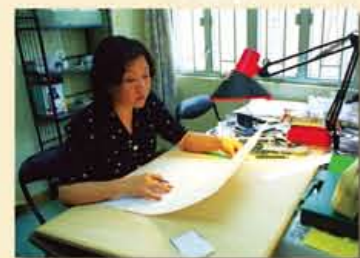
廣東省文物考古研究所的人員正為敬羅家塾繪製測繪圖 A member of the Guangdong Provincial Institute of Cultural Relics and Archaeology working on the measured drawings of King Law Ka Shuk

The main objectives of the project, apart from fully repairing the building, were to restore it into the architectural style of the Qing dynasty by removing all the inappropriate modern building materials and to carry out improvement works, such as the installation of lighting and power supply to facilitate night time functions, the upgrading of the kitchen facilities and the re-laying of the front courtyard.