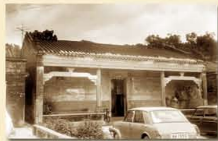
1978年的敬羅家塾 King Law Ka Shuk in 1978

敬羅家塾是中國傳統的三進兩院式建築，裝飾典雅樸實。正脊及牆頭飾有幾何圖案的灰塑，而屋內的檐口板則以花草圖案為點綴。門前建有兩個鼓台，鼓台上各有兩支花崗岩石柱承托屋頂。書塾中進正廳有一座雕刻精緻的神龕，於1932年特地從廣州訂製，分六層安放神主，供奉的先祖由元亮公至敬羅公。