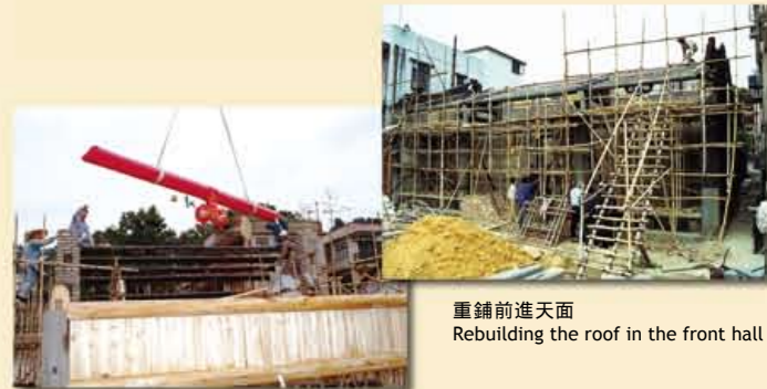
安裝主樑 Installation of the main beam

在工程進行期間，村民代表均有出席工程人員每周工作會議及參與視察工程進度，並提出寶貴意見。