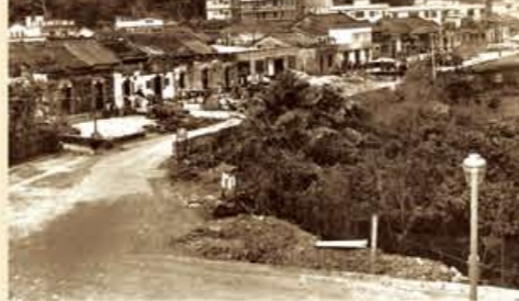
1970年代的大埔頭村 Tai Po Tau Tsuen in the 1970s