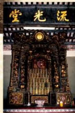
1932年特別從廣州訂製的神龕 Altar of King Law Ka Shuk which was specially made in Guangzhou in 1932

King Law Ka Shuk is a traditional Chinese three-hall, two-courtyard building. Its design is functional with elegant ornamental features. Its roof ridges and wall friezes are mainly decorated with geometric plaster mouldings whereas the internal eave boards are patterned with leafy and floral motifs. The study hall is fronted by two drum terraces, each with two