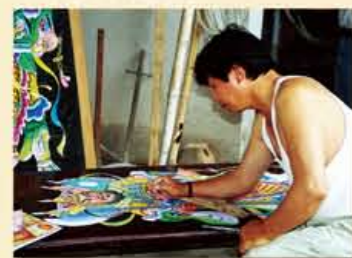
畫師正在繪畫正門門神 The artist drawing the door god of the main door

The full restoration commenced on 3 November 1998. Among all the rituals of restoration of traditional Chinese buildings, beam raising is the most significant. The ridge purlin lifting ceremony took place on 3 June 1999 in which all the senior members of the clan participated.