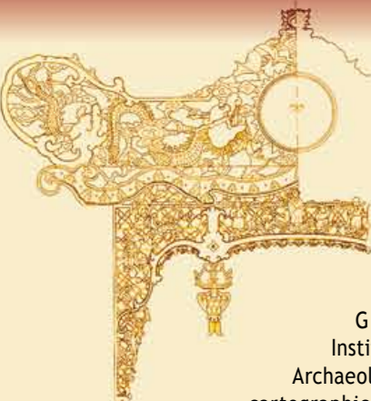
神龕細部 Details of the altar