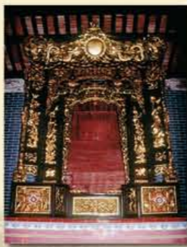
修復後的神龕 The altar after restoration

The antiques and decorations of the ancestral hall were carefully repaired, conserved and restored to their original state. The murals on the façade, the altar, the wood carvings and name boards, for instance, were all restored by professional conservators. Well maintained and featuring superb craftsmanship, the altar, which was specially ordered from Guangzhou by the Tang clan during the restoration in 1932, is the most exquisite relic of the ancestral hall. The Antiquities and Monuments Office commissioned an experienced conservator from the United Kingdom to restore the altar and other relics. Apart from thorough cleaning, he and his team fully repaired, restored and re-gilded the altar to return it to its original splendor. Other relics such as historic name boards, soul tablets and wooden couplets were also carefully restored.