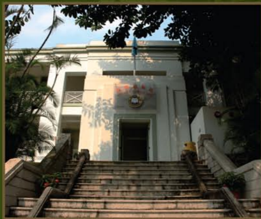
香港浸會大學 視覺藝術院 (前皇家空軍 軍官俱樂部) 九龍觀塘道51號 Academy of Visual Arts, Hong Kong Baptist University (former Royal Air Force Officers' Mess) 51 Kwun Tong Road, Kowloon