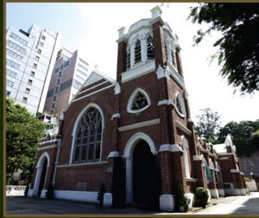
聖安德烈堂 九龍尖沙咀 彌敦道138號 St. Andrew's Church 138 Nathan Road, Tsim Sha Tsui, Kowloon