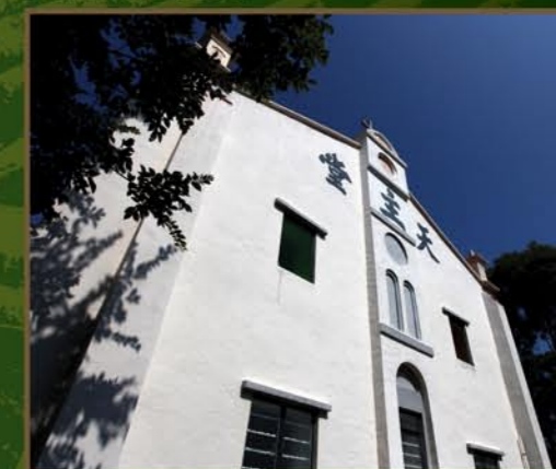
聖若瑟小堂 新界西貢 鹽田梓 St. Joseph's Chapel Yim Tin Tsai, Sai Kung, New Territories