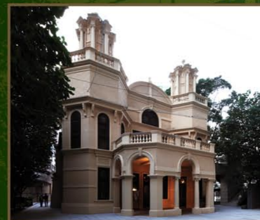
猶太教莉亞堂 香港半山 羅便臣道70號 Ohel Leah Synagogue 70 Robinson Road, Mid-levels, Hong Kong