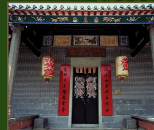
敬羅家塾 新界大埔 大埔頭村 King Law Ka Shuk Tai Po Tau Village, Tai Po, New Territories