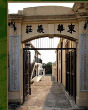
東華義莊 香港大口環道9號 Tung Wah Coffin Home 9 Sandy Bay Road, Hong Kong