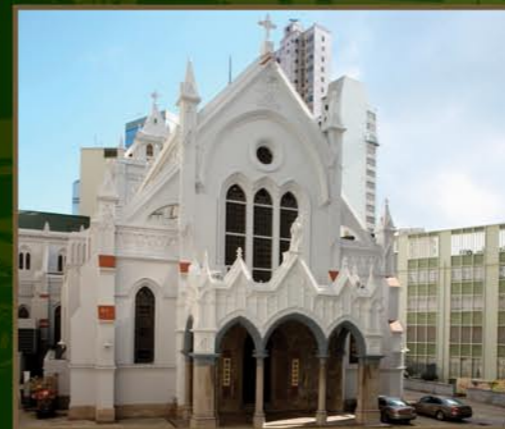
聖母無原罪 主教座堂 香港堅道16號 Cathedral of the Immaculate Conception 16 Caine Road, Hong Kong