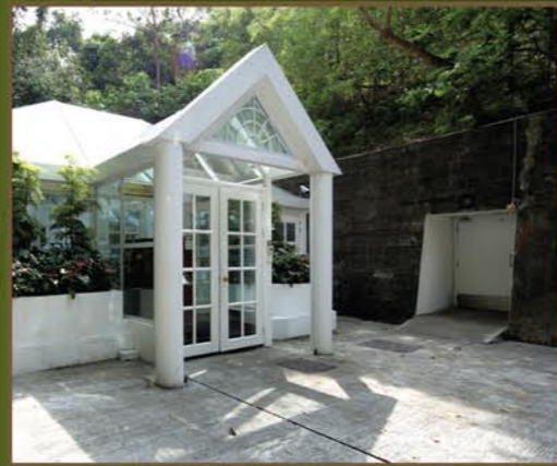
小香港 (前中央彈藥庫) 香港壽臣山 深水灣徑18號 Little Hong Kong (former Central Ordnance Munitions Depot) 18 Deep Water Bay Drive, Shouson Hill, Hong Kong

評判團嘉許創新獎 Jury Commendation for Innovation