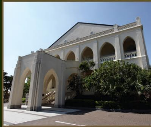
伯大尼 (香港演藝學院 古蹟校園) 香港薄扶林道 139號 Bethanie (Heritage Campus, Hong Kong Academy for Performing Arts) 139 Pokfulam Road, Hong Kong