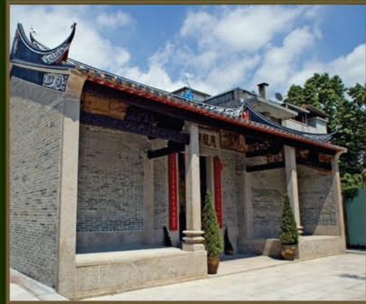
應龍廖公家塾 新界上水圍 莆上村 Liu Ying Lung Study Hall Po Sheung Tsuen, Sheung Shui Wai, New Territories