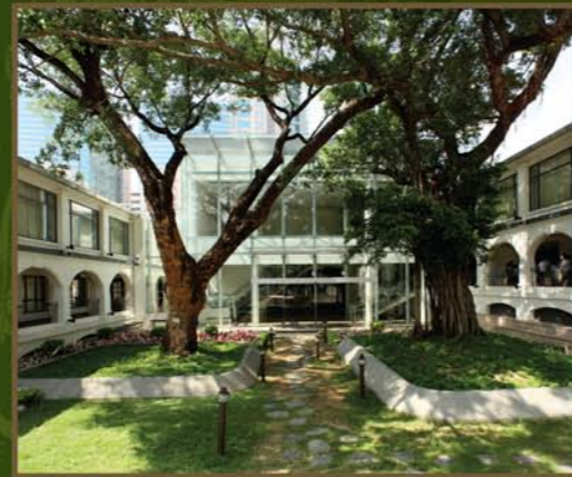
香港文物探知館 (前威非路軍營) 九龍尖沙咀 九龍公園 Hong Kong Heritage Discovery Centre (former Whitfield Barracks) Kowloon Park, Tsim Sha Tsui, Kowloon

評判團嘉許創新獎 Jury Commendation for Innovation