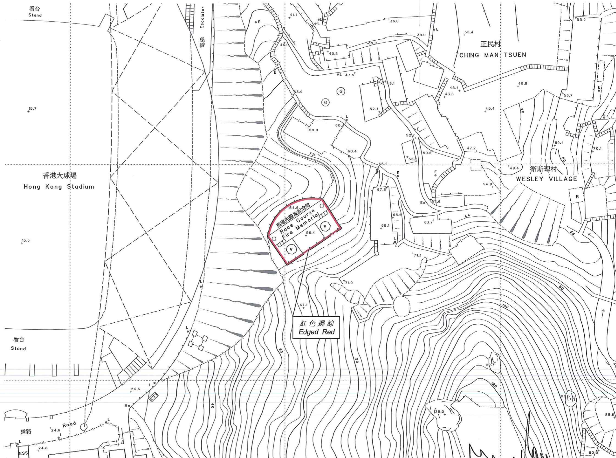
以紅色邊線標示的面積約為 640 平方米 EDGED RED AREA 640 SQUARE METRES (ABOUT)