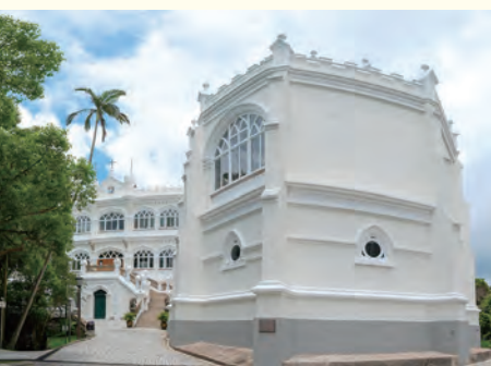
角樓 Corner Tower

The Exterior of University Hall, The University of Hong Kong