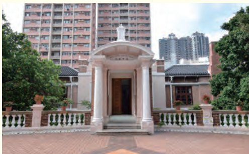
正立面 Front elevation