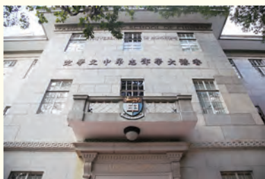
「上海批盪」的外牆 Walls in Shanghai plaster

香港大學於一九一二年成立後不久，即設立文學院。一九二七年校方獲得本地和海外華人捐款，成立中文學院，惟學院成立初期並無專用課室。一九二九年鄧志昂先生慷慨捐貲，於現址興建新教學大樓。取名鄧志昂中文學院。大樓於一九三一年九月二十八日由當時的香港總督貝璐爵士主持開幕。直至一九五〇年代初，大樓一直用作中文及其他文科課程的主要授課地點。一九八二年至二〇一二年期間，大樓由亞洲研究中心使用，現在用作饒宗頤學術館。