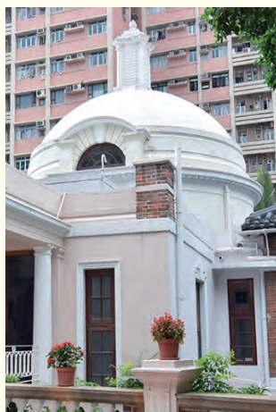
大樓圓頂 Dome of the building

孔慶熒樓樓高兩層，是一座具古典復興建築風格的紅磚建築物。大樓中央的半圓形屋頂別緻矚目；左右兩翼則為長方型副樓，兩翼的南立面均豎立了高矗的煙囪，而北立面則建有柱廊。