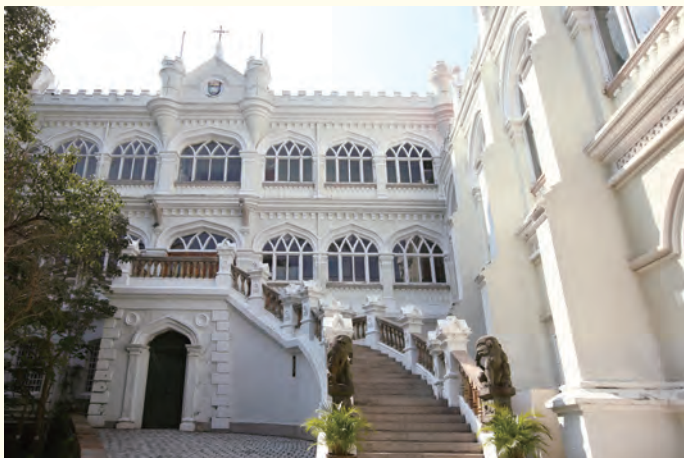
正門樓梯 Staircase at main entrance