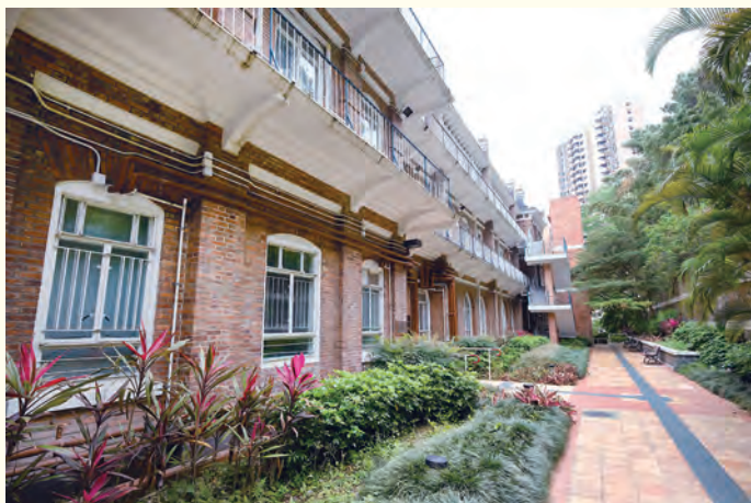
背立面 Rear elevation

May Hall was opened on 1 January 1915 as the third student residential hall under the direct management of The University of Hong Kong. It was named after Sir Francis Henry May, the second Chancellor of The University of Hong Kong and the 15th Governor of Hong Kong.