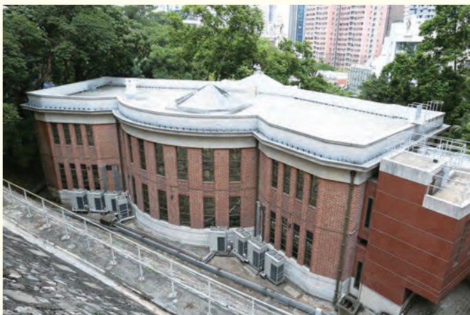
背立面 Rear elevation

This three-storey, symmetrically constructed building has a fan-shaped floor plan with a rounded central section. The facade is mainly constructed of red brick and is decorated with giant pilasters, window architraves, pediments, parapets and moulded cornices. The atrium features a high-level circular gallery supported on octagonal columns, which is lit by a prominent skylight on the roof. Most of the old finely carved hardwood doors and windows with original brass fittings are still in place.