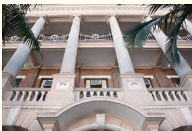
文藝復興風格的花崗石柱 Renaissance style granite colonnades

這座樓高三層，比例勻稱，由多條古典的愛奧尼式花崗岩石柱支撐的紅磚大樓，布局工整。大樓以正面中央的鐘樓作為中軸線，每邊各建角樓兩座。入口門廊和東、西兩面的女兒牆上飾有三角形山花。大樓的遊廊，是西式建築物為適應亞熱帶氣候的設計。