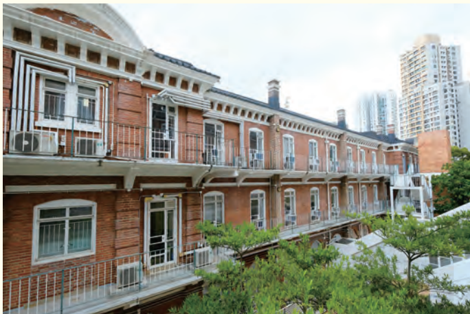
面向梅堂的背立面 Rear elevation facing May Hall