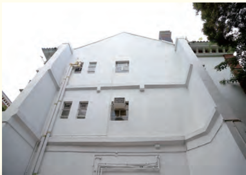
一九六六年發生嚴重山泥傾瀉後，倒塌部分加建兩道扶壁。 Two buttresses were erected at the collapsed portion after the severe landslide in 1966.

During the Second World War, Eliot Hall became a relief hospital providing additional support for Queen Mary Hospital. The building was turned into a gymnasium in 1956, and subsequently renovated as a student residential hall in 1963. In June 1966, a prolonged period of torrential rain caused a massive landslide on the slope adjacent to Eliot Hall and May Hall, which led to an immediate evacuation of the two halls and necessitated extensive repairs. Two wardens' quarters at the east end of Eliot Hall and May Hall had to be demolished. The university took this opportunity to combine Lugard Hall, Eliot Hall and May Hall into one large residential unit named Old Halls, which was opened in 1969 and consisted of three wings, namely Lugard Wing, Eliot Wing and May Wing. Eliot Wing reverted to its old name Eliot Hall when Lugard Wing was demolished in 1992.