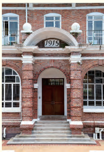
正門近景 Close view of the main entrance

梅堂於一九一五年一月一日啓用，是第三幢由香港大學直接管理的學生宿舍，以第十五任香港總督兼香港大學第二任校監梅含理爵士命名。