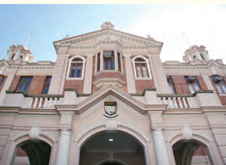
正門 Front entrance