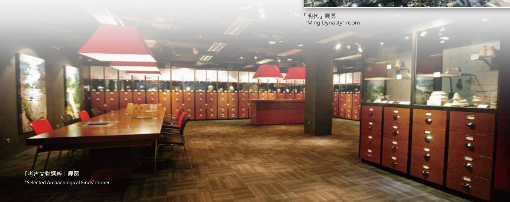
「考古文物選粹」展區 "Selected Archaeological Finds" corner