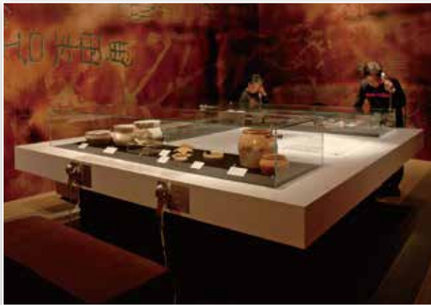
「漢代」展區 "Han Dynasty" room