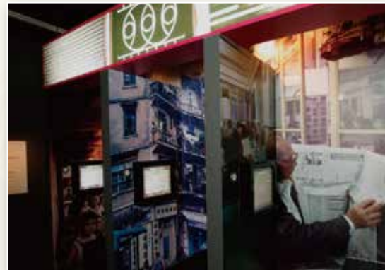
「現代建築」展區 "Modern Architecture" room