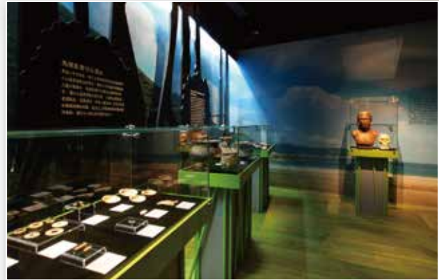
「史前時期」展區 "Prehistoric Period" room