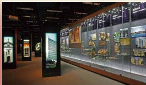
文物廊 Heritage Wall