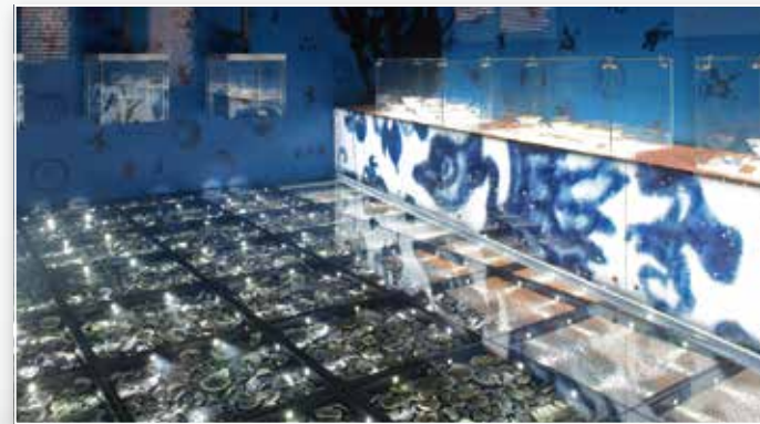
「明代」展區 "Ming Dynasty" room