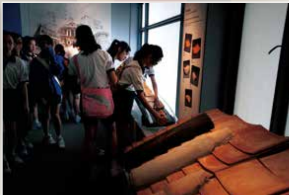
「復修及活化」展區 "Conservation and Revitalisation" corner