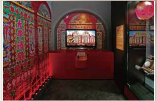
「中式建築」展區 "Chinese Architecture" room