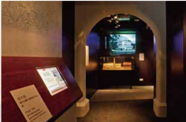
「西式建築」展區 "Western Architecture" room

In addition, the conservation and revitalisation of built heritage in Hong Kong are introduced, so that visitors can learn about the relationship between heritage conservation and cultural legacy.