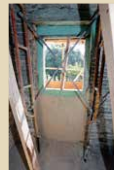
修復期間展露出一樓窗戶的原有門洞痕跡 Remnants of the original door at a window on the first floor were revealed during restoration

The fortified structure at Ha Pak Nai was declared a monument in June 2011 and is now protected by the Antiquities and Monuments Ordinance.