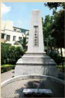
鄧蔭南在廣州東郊七寶崗興中會墓園的墳墓。 The grave of Tang Yam-nam in the Xing Zhong Hui cemetery at Qi Bao Gang on the eastern outskirts of Guangzhou.

1895年10月，鄧蔭南參與了廣州起義，惟風聲外洩而事敗。1900年，鄭士良 (1863-1901) 發動惠州起義，鄧蔭南嘗試在廣州暗殺兩廣總督、廣東巡撫德壽，以作配合，惟暗殺行動失敗。逃回香港後，負責青山農場的事務，繼續支援革命運動。