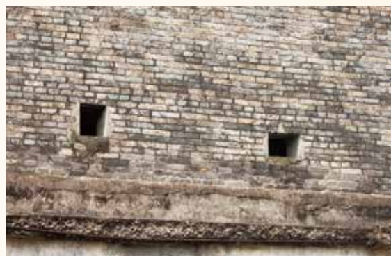
碉堡的槍孔 Embrasures of the fortified structure

Ha Pak Nai is located at Nim Wan, Yuen Long, overlooking Deep Bay. Sparsely populated in the early 20th century and characterised by long mudflats and woods along the coast, the area offered an excellent refuge. When the revolutionaries failed in the uprisings in Guangzhou, they were able to flee over the water to Nim Wan to find sanctuary in the fortified structure and the vicinity, which could also be reached by land or sea from the Castle Peak Farm if it was at risk of being raided.