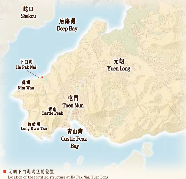
■ 元朗下白泥碉堡的位置 Location of the fortified structure at Ha Pak Nai, Yuen Long