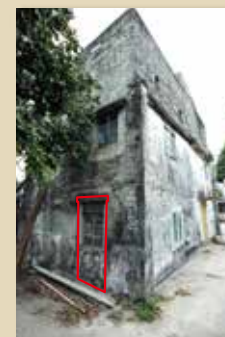
修復前地下側門曾改作窗戶 The side door on ground floor had been converted to a window before restoration