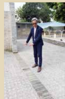
前方空地尚存原有相鄰房屋的磚砌牆基 The brick foundations of the original adjoining house are still retained in the foreground