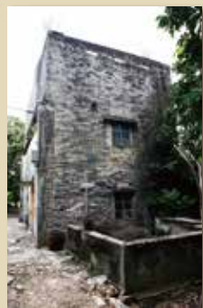
2011年的下白泥碉堡 The fortified structure at Ha Pak Nai in 2011

The fortified structure at Ha Pak Nai in Yuen Long, built around 1910 after the New Army Uprising in Guangzhou, is a building with a direct connection to the late Qing revolutionary movement.