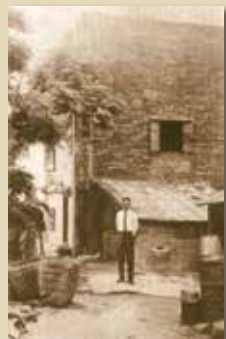
1965年的下白泥碉堡 The fortified structure at Ha Pak Nai in 1965

下白泥位處元朗稔灣，面向后海灣。二十世紀初是人煙稀少的地方，加上沿岸的長泥灘和叢林，有利匿藏。若革命黨人在廣州起義失敗，可從水路逃到該處；如果青山農場發生事故，他們也可循水路或陸路逃到稔灣，在碉堡及附近匿藏。