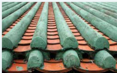
以中式柏油瓦鋪蓋的斜形屋頂 Pitched tarred Chinese tiled roof