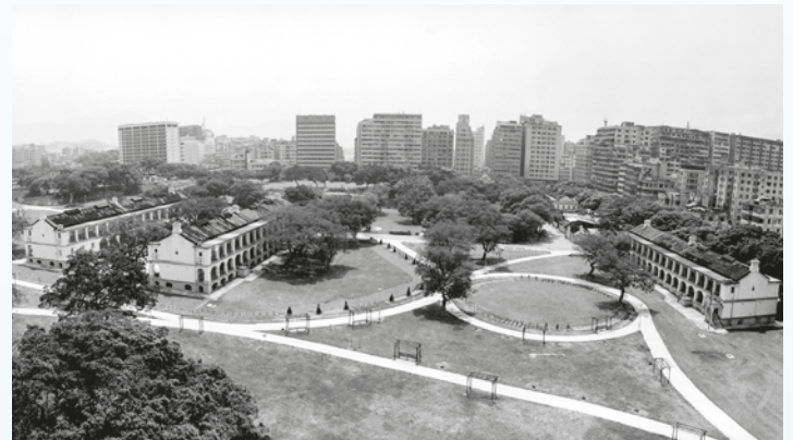
一九七 年剛建成的九龍公園，四座獲保留的威菲路軍營營房清晰可見。 View of the newly completed Kowloon Park in 1970. The four blocks of Whitfield Barracks that have been preserved can be clearly identified.