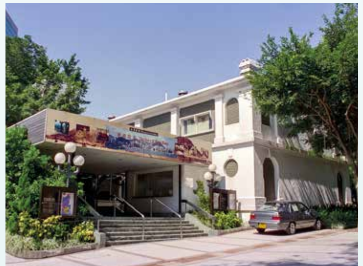
S61及S62座曾於一九八三至一九九八年間用作香港歷史博物館的臨時館址，並於兩座大樓中間加建入口及售票處。 Blocks S61 and S62 were used as the temporary premises of the Hong Kong Museum of History from 1983 to 1989, with an entrance hall and ticket office built between them.