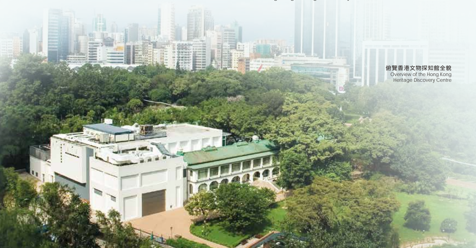
俯覽香港文物探知館全貌 Overview of the Hong Kong Heritage Discovery Centre

Starting in 1967, Whitfield Barracks was handed over in stages to the government for redevelopment as a cultural and leisure venue, and the site was eventually opened to the public in 1970 as Kowloon Park, with only the Kowloon West II Battery and four barrack blocks – S4, S58, S61 and S62 – preserved. Blocks S61 and S62 were used from 1983 to 1998 as the temporary premises of the Hong Kong Museum of History; an exhibition hall was built between them in 1989. The blocks were restored by the Antiquities and Monuments Office in 2003 and subsequently developed into the Hong Kong Heritage Discovery Centre in 2005.