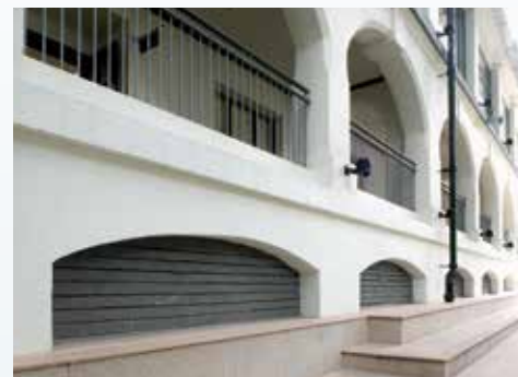
柱廊下的半懸地庫 Raised semi-basement under colonnaded verandah