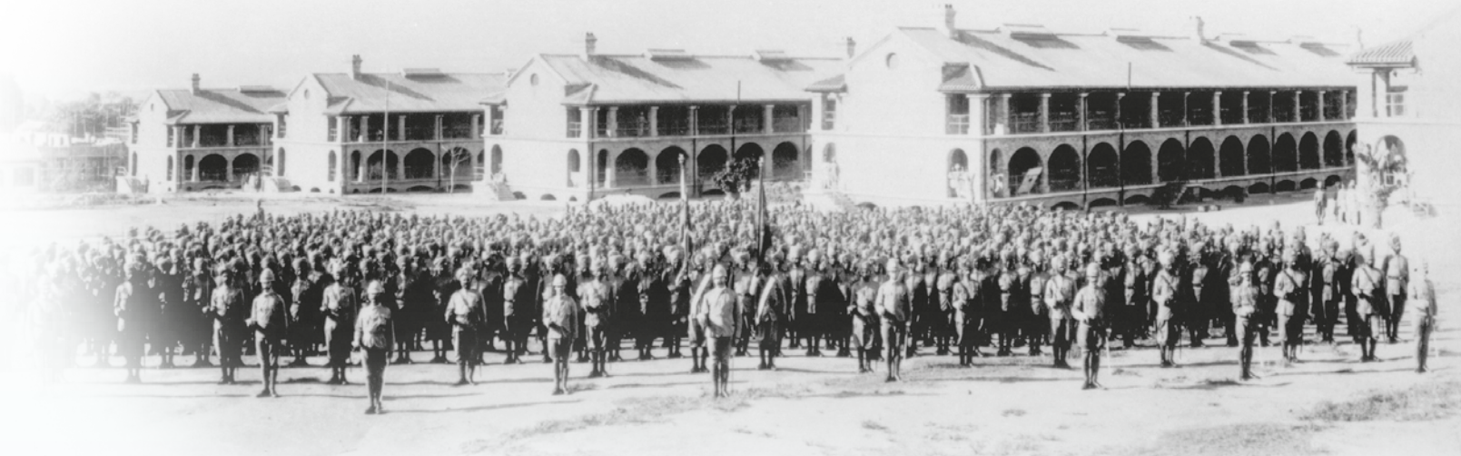
由印籍軍人組成的香港軍團在威菲路軍營進行操練，約攝於一八九七年。 The Hong Kong Regiment, made up of Indian troops, parading at Whitfield Barracks, circa 1897.