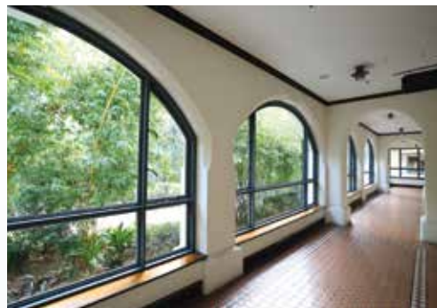
深邃寬敞的扁拱柱廊 Deep flattened arch colonnaded verandah

The design of Blocks S61 and S62 was typical of military buildings constructed by the British.