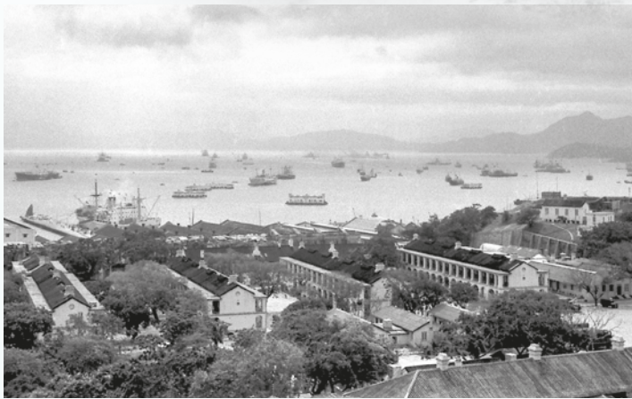
一九六 年代的威菲路軍營 Whitfield Barracks in the 1960s