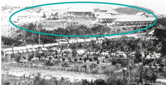
約一八九五年的威菲路軍營（圓圈者），右上方有些用草棚搭建的軍營。 Whitfield Barracks (circled) circa 1895, with some mat-shed buildings visible in the top right of the photo.

Located in Kowloon Park, once the site of the British Army's Whitfield Barracks, the Hong Kong Heritage Discovery Centre is housed in two of the old barrack blocks, S61 and S62, which were probably built in the late 1890s and which were later restored and then converted into the Centre in 2005. It has the mission of enhancing public awareness of our local heritage and its preservation by presenting a variety of exhibitions and educational activities.