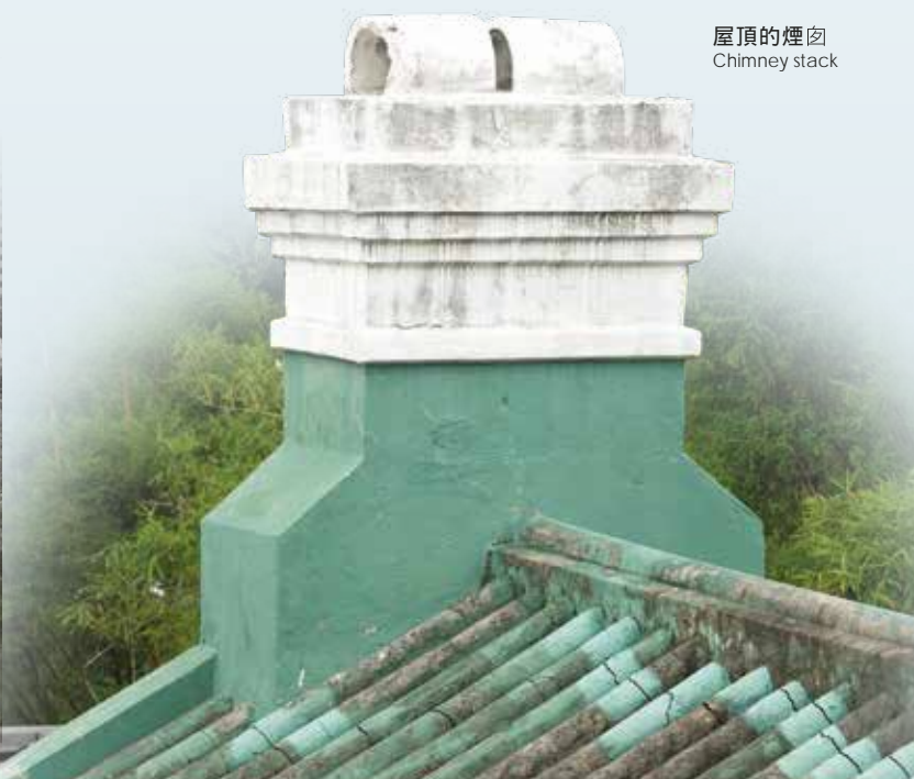
屋頂的煙囪 Chimney stack