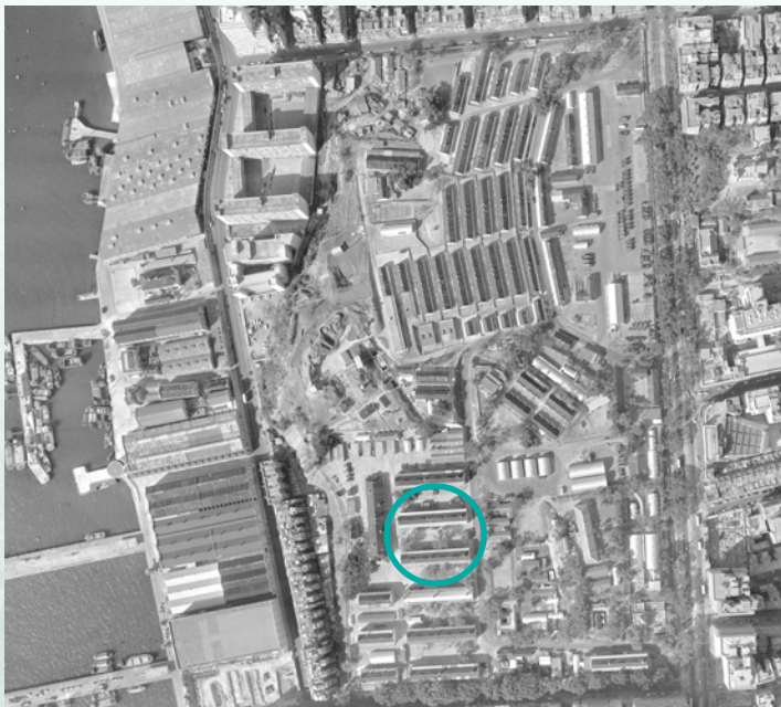
一九六四年從高空俯覽整個威菲路軍營，圓圈內的營房為S61及S62座。 An aerial view of Whitfield Barracks, 1964, the two circled barracks are Blocks S61 and S62.