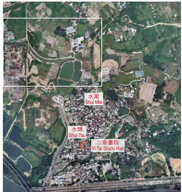
2012年的錦田水頭村、水尾村及二帝書院 Shui Tau Tsuen, Shui Mei Tsuen and Yi Tai Study Hall at Kam Tin in 2012