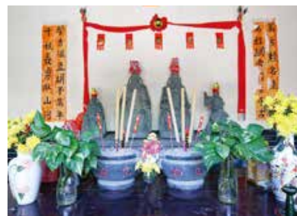
擺放於二帝書院二星閣內的新造神像 Newly made statues at Yi Shing Kok of Yi Tai Study Hall