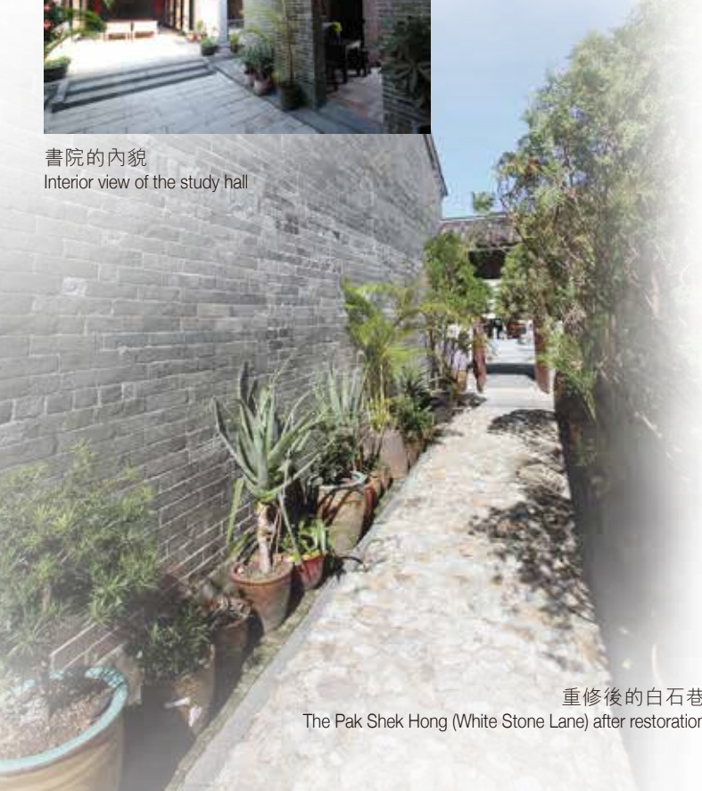
重修後的白石巷 The Pak Shek Hong (White Stone Lane) after restoration