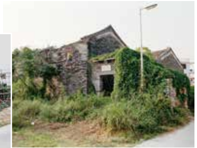
修復前的二帝書院 Yi Tai Study Hall before restoration