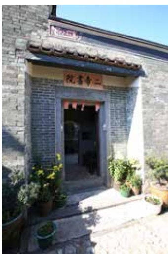
二帝書院正門 Main entrance of the Yi Tai Study Hall