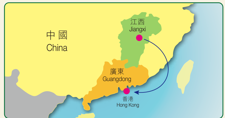
鄧氏先祖由江西省遷徙至錦田 Migration of the Tang's ancestors from Jiangxi province to Kam Tin

Having settled in Kam Tin for around nine centuries, the Tangs proceeded to establish five wai (walled villages) in the area – Nam Wai, Pak Wai, Kat Hing Wai, Tai Hong Wai and Wing Lung Wai – and other villages such as Shui Tau Tsuen, Shui Mei Tsuen and Tsz Tong Tsuen.