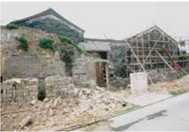
書院進行緊急維修 The emergency repair of the building

A rehabilitation ceremony celebrating the completion of the restoration was held on 4 December 1994. The study hall has been open to the public ever since.