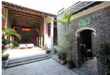
書院的內貌 Interior view of the study hall

二十世紀初期推行現代教育，二帝書院亦演化成一所小學，約有學生30人。在日佔時期（1941至1945年），書院雖仍有供奉文武二帝，但已不再作學校用，戰後則一直空置。