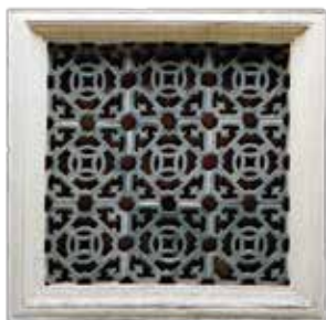
飾有不同花紋的漏窗 Ceramic grilles decorated with different patterns