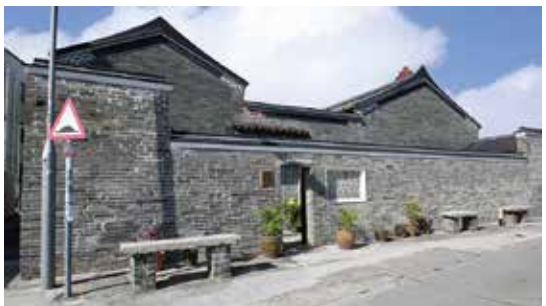
修復後的書院外觀 View of the study hall after restoration