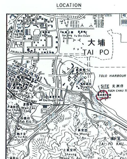
SCALE 1 : 20 000