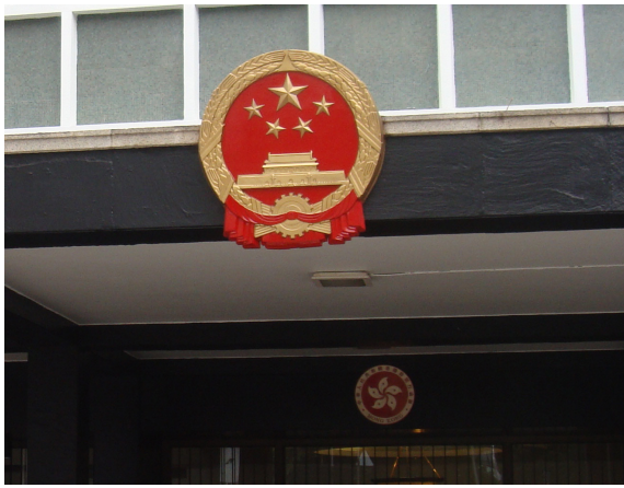
The emblems of the HKSAR and the People's Republic of China above the Central Wing main entrance

The CGO saw the handover of government from Britain to the People's Republic of China and the formation of the HKSAR Government. The transfer of power officially took place at midnight on the 1 st July 1997. The last governor of Hong Kong, Chris Patten, departed Hong Kong that night. Government House then became the official residence of the Chief Executive. The first Chief Executive, Mr Tung Chee-hwa, chose not to live in Government House so Mr Donald Tsang, the second Chief Executive, was the first to live there. Changes were made at the CGO, including the replacement of all the Royal crests with the new emblem of the HKSAR and the erection of a fence around the compound. The transfer of power is one of the most important events in Hong Kong's history which marks a new era for the country and it is significant that the CGO were closely associated with these changes.