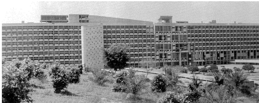
Le Corbusier's Secretariat at Chandigarh, India (Roth, 2007, p.80)