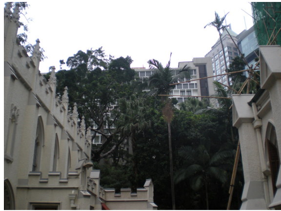
The CGO are partly screened by the trees. Old Hall is on the left.

The CGO are partly screened from the historic buildings below (ie Cathedral and French Mission Buildings) by the planting and trees on and around the CGO site. This protects the historic buildings and softens the potential impact that the CGO buildings could have on them. It was not possible to gain access to the north lawn of Government House to assess the view of the CGO from there. The CGO will certainly make up a substantial part of the view towards the harbour but, of course, the skyscrapers behind the CGO block this view now. The focus of the view is changed from the original view when the CGO were first constructed.