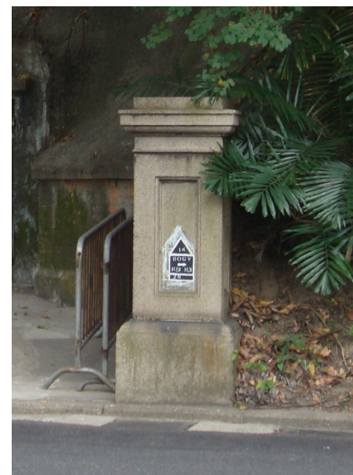
Gate post on Lower Albert Road