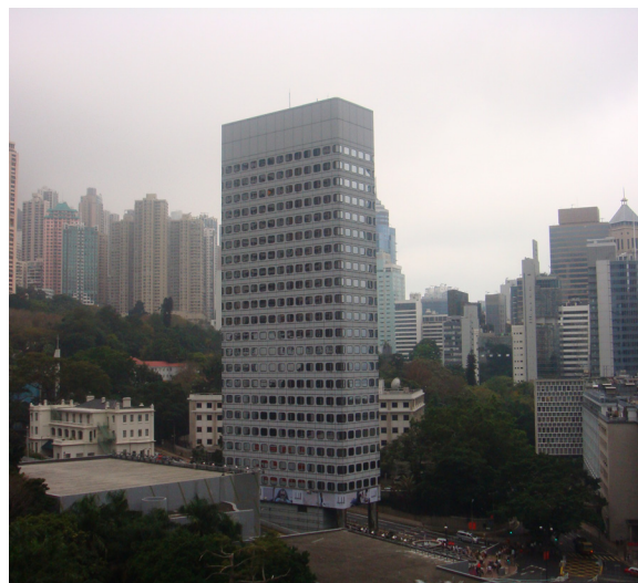
The view from the vantage point tower in the park.

One of the features of the Hong Kong Park is a thirty metre Vantage Point tower which offers panoramic views of the city, including the area over towards the CGO. From the tower the south side of the East Wing and the east side of the Central Wing are visible behind the Murray Building. This is not the best view of the CGO as all the plant on the roof of the East Wing can be seen. What is perhaps more significant is the amount of open space in this area. Government House is blocked from view by a tall building (St John's Building) on Garden Road but the trees along Lower Albert Road, the Zoological Gardens to the south and the