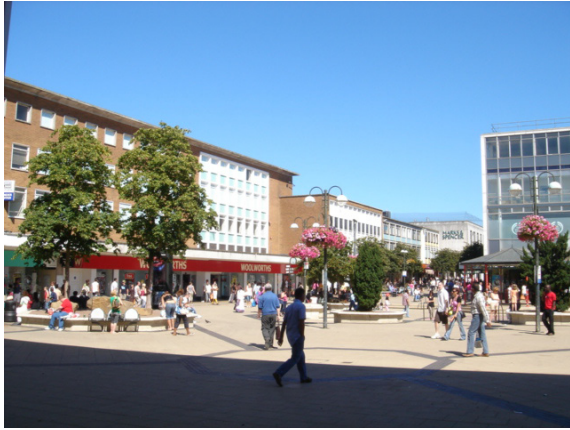
Queen's Square, Crawley