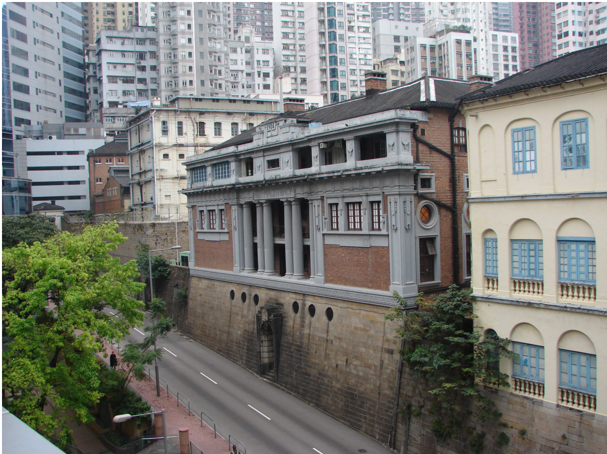
The Magistracy building on the Central Police Station Compound

To the west of the CGO are two of the other main historical sites in Central; the Sheng Kung Hui Compound and the Central Police Station Compound. The Sheng Kung Hui site has two graded buildings; Bishop's House (grade I) and the Old S.K.H. Kei Yan Primary School (grade II). The site was formerly the location for St. Paul's College, which moved off the site in 1951. Most of the rest of the buildings on the site are a jumble of 20 th century buildings in varying states of repair. Across the road from this site is also the Old Dairy Farm Depot, a Grade II building with a distinctive brick and stone striped façade.