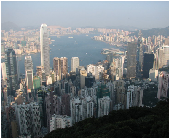
The view from the Peak with the CGO towards the right of the image

Park surrounding the tower all constitute the 'green lung' discussed above. It is significant that it is possible to get a view like this of the CGO and surrounding area at all in this densely built up city.