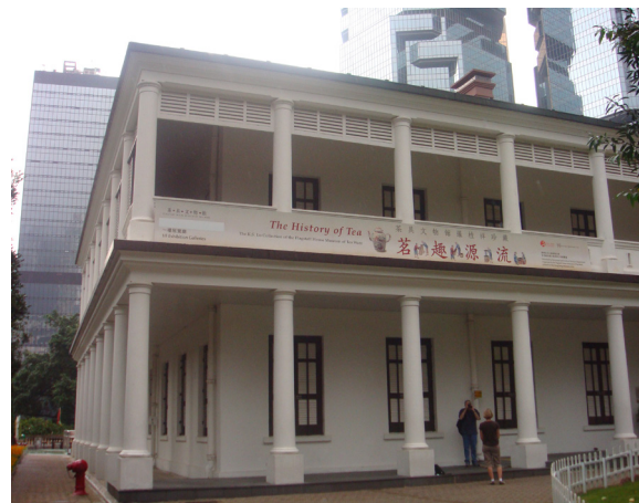
The Flagstaff Museum of Teaware

Near to the CGO and Government Hill are some of the other remaining historic sites in Hong Kong. The Hong Kong Park to the east of Government House was opened in 1991 after it was converted from a garrison called Victoria Barracks. The park still contains several colonial era buildings which have been converted for use as park administration (Rawlinson House), a museum (the Flagstaff House Museum of Teaware), an education centre (Wavell House) and the Hong Kong Visual Arts Centre (Cassels Block). This is another example of a collection of historic buildings in Central. The surrounding area has, however, been altered and adapted for use as the park and there is little sense of historical context.