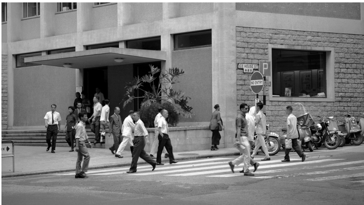
A photograph showing the West Wing entrance in 1964 (GIS, 3121-1)

The CGO are architecturally important as a good example of 1950s 'Functional' architecture in Hong Kong. They have, however, been significantly altered internally and to a lesser extent externally so that their appearance now is not as coherent as when they were originally constructed. The architectural quality of the three blocks is not of equal value. The Central Wing and East Wing being of a higher quality than the more utilitarian West Wing. There is some significance attached to the group value of these buildings showing the design development over a short period of time – however, the relationship of the West Wing to the Central Block lies only with the east end of the building which has been compromised by the later extension.