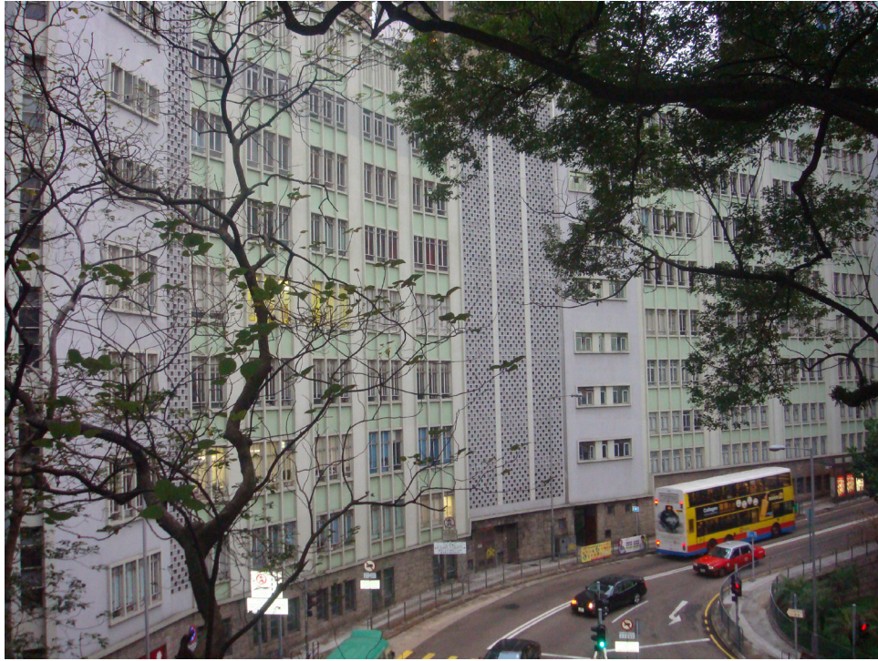
The Caritas College, constructed in a similar style to the CGO

Caritas Francis Hsu College. It is an example of a building that shares many characteristics with the CGO. Firstly, it is a low rise building of eight to nine storeys. The most similar features are the windows which are set in a comparable grid system with projecting horizontal and vertical elements and rendered spandrel panels, very similar to those on the West Wing. These are broken up with full height rendered sections with horizontal groups of windows like on the east end of elevation 3 of the East Wing, though the tall panels of lattice block work are not represented on the CGO. It is also interesting to note how this building was also constructed adjacent to a major religious building, though here the building is much more intrusive structure as it blocks the Catholic Cathedral from view. The public have to make their way around the back of the building in order to view the Cathedral, whereas the CGO do not really obscure St. John's Cathedral in any significant way. It is possible that the design of the CGO introduced this Functional style of architecture to Hong Kong and therefore could have influenced the design of other buildings, such as this one, though no documentary evidence has been found to prove this.