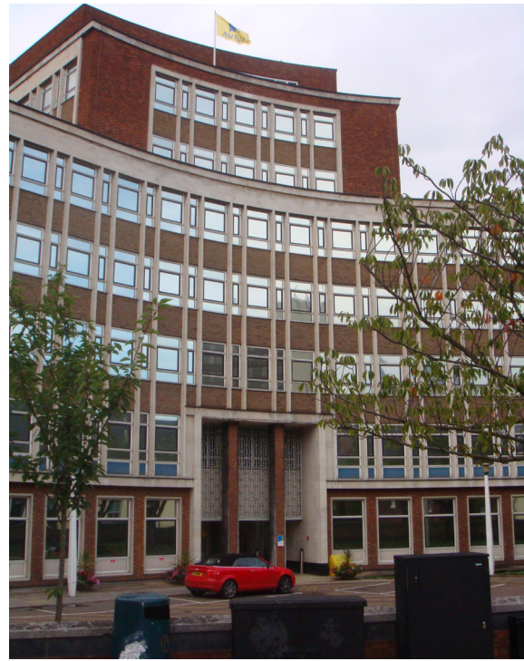
Norwich Union Building

By the 1950s other styles of modern architecture were emerging and architecture in Hong Kong and the design of the CGO were lagging behind the rest of the architectural world somewhat. The 'Functionalist' architecture of the CGO had its roots in the pre-war architecture of architects such as Walter Gropius, Mies van der Rohe, Frank Lloyd Wright and Le Corbusier. After the War architects began to turn to techniques like glass curtain walls, for example at Lever House in New York (1951-52 by Gordon Bunshaft, see p.118), reducing the need for exposed concrete frames. Alternatively architects, such as Le Corbusier, were turning to harsher materials like unpainted concrete.