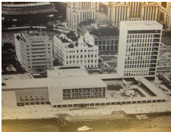
City Hall soon after its construction

The other surviving major piece of modern architecture constructed at the time was City Hall, constructed from the late 1950s and opened on 2 nd March 1962. The building was constructed on a section of reclaimed land on the waterfront as a facility for a theatre, library, art gallery and cultural services 4 . It was designed by British architects Ron Philips and Alan Fitch in a modern design described as being influenced by the Bauhaus 5 . A twelve storey tower housed the library and gallery while a lower building to the east housed the concert hall with a large curtain window looking out to the water.