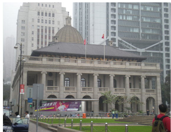
The Supreme Court Building

Being the main government building of the HKSAR, the CGO is a site where many important government decisions were and still are made. The Executive Council has its offices in the Central Wing. This council is a body which assists the Chief Executive on policy (the equivalent of the Prime Minister's cabinet in the UK). The New Annexe was constructed in 1989 to house the offices of the Executive Council members. The council meets once a week on Tuesdays in the Central Wing of the CGO. These meetings are presided over by the Chief Executive himself. This body has been in existence since the 1840s and has gradually expanded from only a handful of members to around 30 members today who are appointed by the Chief Executive.