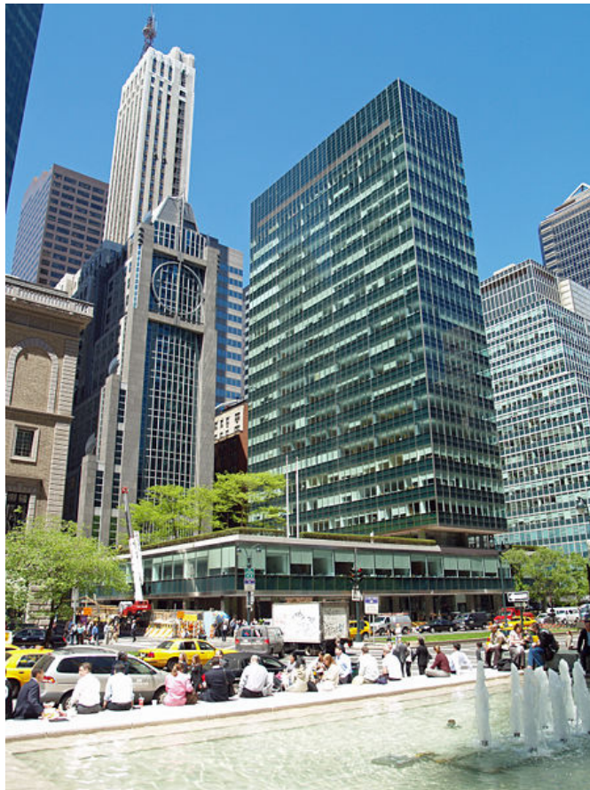
Lever House