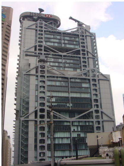
Norman Foster's HSBC building as seen from the CGO compound

One of the main reasons why the CGO are significant is their setting within an open green space adjacent to several important historic buildings. The area known as Government Hill, consisting of Government House, the Government Offices and the Cathedral, was formed in the early days of the Colony. Since the end of the Second World War, when Hong Kong was fast becoming a commercial centre, the rest of the city rapidly expanded upwards while Government Hill remained an area of low rise building and green, open space. Tall buildings are now predominant in the Central District of Hong Kong and several of the most iconic buildings surround the CGO on the north and east sides; Norman Foster's HSBC building, the Cheung Kong Centre and the Bank of China tower. The last of these is one of the tallest in Hong Kong at 1,209ft and seventy storeys 1 , which dwarfs the CGO's seven storeys. The CGO are therefore an unusual low rise survival in Central.