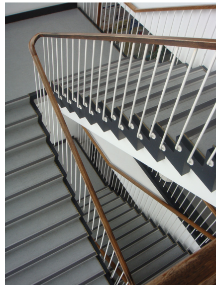
The original staircase in City Hall

been adapted and altered internally, the latter in an extensive renovation in 1993, but City Hall perhaps remains more intact. It retains its original purple coloured tiles and some original woodwork in the concert hall common areas, the original handrails in the full height stairwell in the library block and original window frames which have not been marred by the insertion of air-conditioning units. Together with the CGO City Hall was one of the first ‘modern’ buildings in Hong Kong.