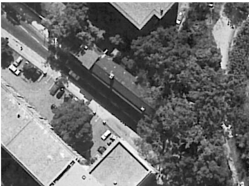
The stables on Lower Albert Road still in existence in this aerial image of 1963