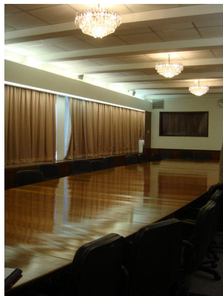
Conference Room with surviving original table

With the exception of some conference rooms in the East Wing, practically none of the original spatial configurations and their uses remain. No important internal areas, such as entrance lobbies, remain intact, original features having been removed. Most of the offices have now been renovated (or are in the process of renovation) to provide smarter offices with better facilities. In many cases this has happened more than once. Those interiors that have not been renovated are tired and no longer provide adequate working conditions; many of the offices are cramped and a small number do not even have windows. One interesting discovery was a handful of pieces of furniture, such as wooden filing trays, umbrella stands and chairs, which are most probably original.