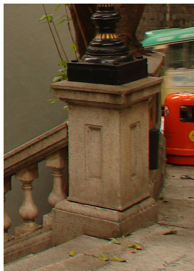
Stonework of the Duddell Street steps