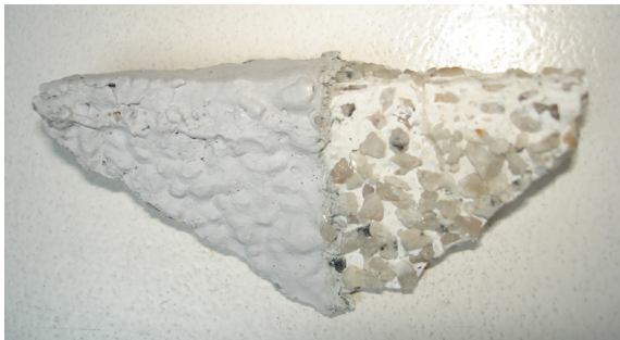
A sample of the concrete from the West Wing

In terms of construction the design of the CGO buildings were a good solution to the problem of accommodating large structures on a site with such varied levels. The site has a flat central area but on the east, north and west ends it slopes away, especially at the west end where the slope is very steep. The West Wing therefore is seven storeys at the centre of the site and gradually lower floors are added to the west end as the ground slopes away so that there are ultimately thirteen storeys. This means that the site can be used fully and that there is a public entrance to the buildings at the Ice House Street level.