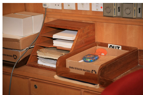
Possible original wooden filing trays