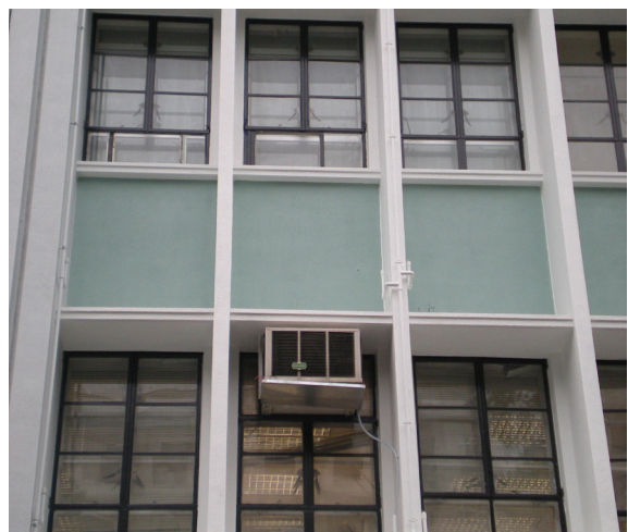
Examples of the common language of form on the CGO