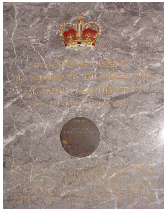
The commemorative plaque in the Central Wing lobby

plaque, erected to commemorate the opening of the Central and East Wings of the CGO, incorporates the foundation plaque for the first Government Offices discovered during the demolition. It records that the Governor Sir John Francis Davis laid the foundation stone on the 24 th January 1847. The plaque is a reminder of the history of the CGO site.