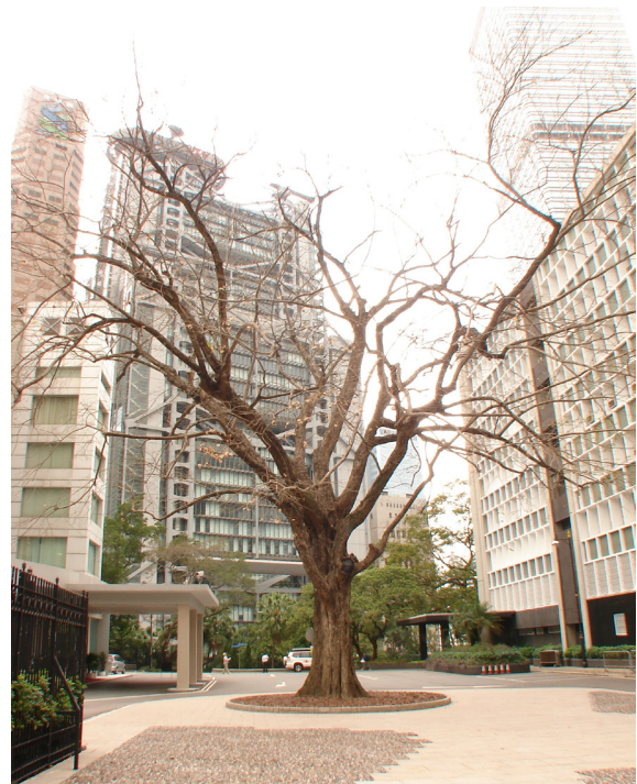
The Burmese Rosewood in the CGO courtyard

The CGO are located in a prominent part of the Central District of Hong Kong. The public are free to use parts of the area around the CGO. Battery Path is a popular public thoroughfare up through the Cathedral compound to Garden Road and many also use it to access the overhead walkway across Queen's Road Central. The Cathedral compound can be used as a quiet place to sit and rest. The CGO itself must be a pleasant area in which to work as it provides a quiet oasis in the middle of the city with gardens shaded by trees to the north of the Central Wing. Five of these trees are protected on the Register of Old and Valuable Trees because of their large size or outstanding form. The Burmese Rosewood in the central courtyard is also on the Register because of its historical significance.