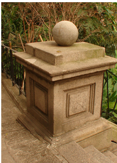
Battery Path steps stonework

These historic features increase the understanding of how the site has developed and show how it has always been at the centre of the development of Hong Kong. All these features have significance and can be used for the interpretation of the history of the site.